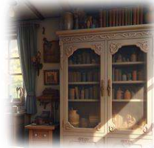
( cupboard – Tv )