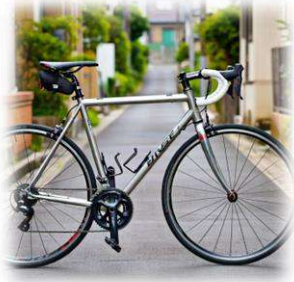
(( b...k....)) دراجة