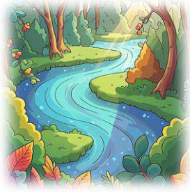
(( r...ve.....)) نهر