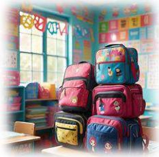
( bags – paints )