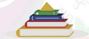
Egyptian Knowledge Bank بنك المعرفة المصري