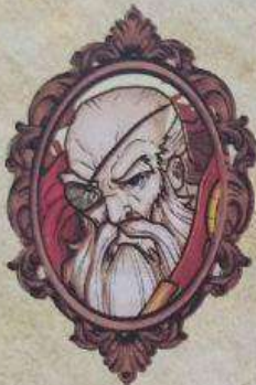
Long John Silver