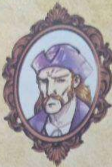
Captain Smollett, the ship's captain