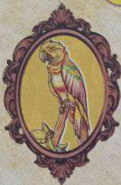
Captain Flint, His parrot