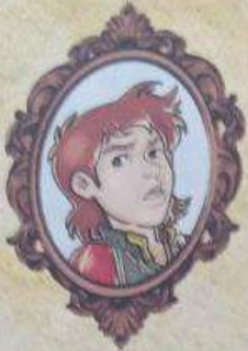
Jim Hawkins, A young teenage boy